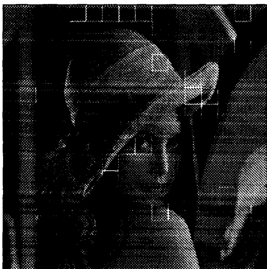
Figure 3. System with switching: bit-rate 0.77 bpp PSNR 34.84 dB, hybrid KLT-SVD blocks are marked

When using the switching system it is interesting to find out how many blocks are used from the KLT codec and how many blocks are used from the hybrid KLT-SVD codec. In our simulations the percentage of used hybrid KLT-SVD blocks varied from 3.1 % to 9.8 %. In Figure 3 we show the reconstructed image using the switching system at a bit-rate of 0.77 bpp. Here 25 out of 256 blocks are coded using the hybrid KLT-SVD codec. The blocks using hybrid KLT-SVD are marked with a white border. It is difficult to find a pattern of which method that is used for the different blocks, but the knowledge of SVD indicates that transform blocks within the chosen 32 \times 32 blocks have low rank.